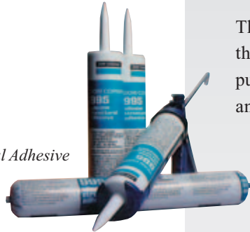
Silicone Structural Adhesive

The flexibility of this system will also increase the ability of the system to cycle due to blast pulse and wind storm energies that create positive and negative pressure effects or by twisting forces associated with earthquakes. In addition, resistance to smash-and-grab and forced-entry impacts can also be improved with the installation of Ultraflex.